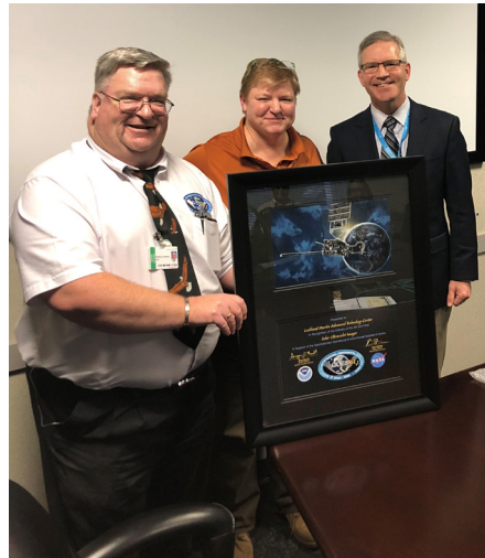
The SUVI development team was honored with a plaque commemorating the completion of all GOES-R Series SUVI instruments.

The GOES-T Key Decision Point D Review was conducted on December 20. During the review, a joint NOAA-NASA Program Management Council determined the satellite is ready to proceed to the integration phase.