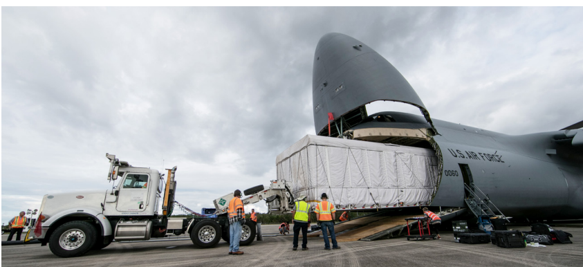
GOES-S emerges from its transport at Kennedy Space Center on December 4.

GOES-S is unwrapped in a clean room at Astrotech Space Operations after arriving in Florida.