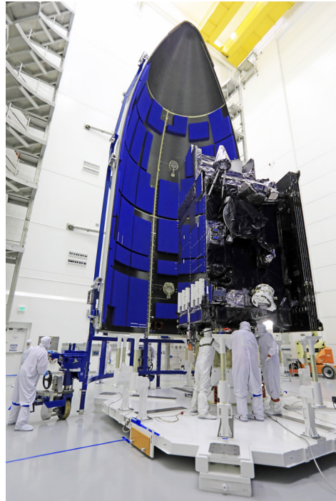
Team members with United Launch Alliance prepare GOES-R for encapsulation in the payload fairing.

GOES-R launch site preparations shut down on October 5, in preparation for Hurricane Matthew, which passed by the Florida coast on October 7. Matthew damaged facilities and equipment at Kennedy Space Center and Astrotech Space Operations, where GOES-R was undergoing preparations for launch. GOES-R was placed in a protective enclosure and made it through the storm unharmed, though delivery of the launch vehicle Atlas booster was postponed. Some ground support equipment was damaged and the GOES-R launch date of November 4 was changed due to impacts from the hurricane. The launch was further delayed in early November due to a minor Atlas V booster issue. All issues were resolved and a new launch date of November 19 was set.