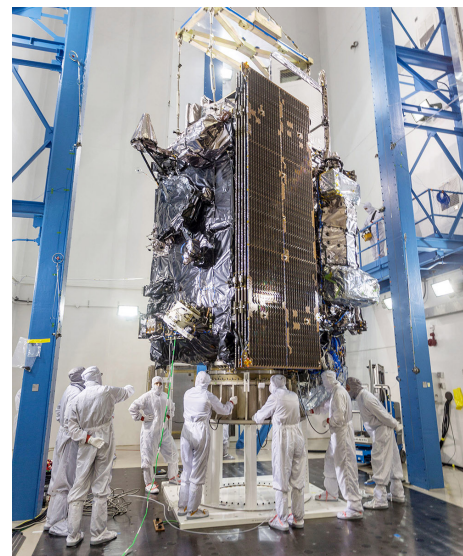
Engineers prepare GOES-S for acoustics testing in November.

The GOES-S satellite is now fully integrated and undergoing environmental testing . GOES-S has completed acoustics and vibration tests and is now preparing for thermal vacuum testing. The environmental assessments, which are conducted at Lockheed Martin Corporation's Littleton, Colorado, facility, subject the satellite to conditions which simulate launch and the harsh space environment. The full set of environmental, mechanical and electromagnetic testing will take about one year to complete.