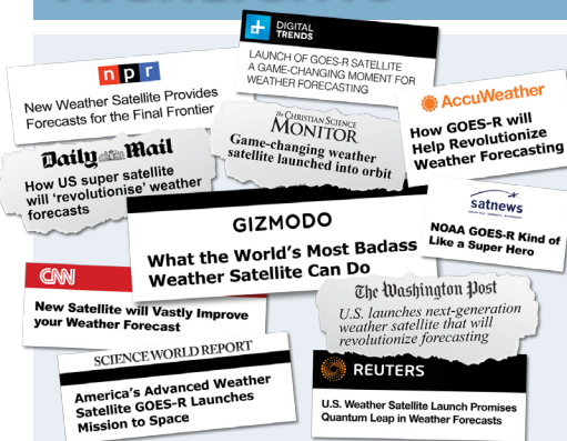
A sampling of GOES-R launch media headlines.

The GOES-R launch received a lot of attention from the media and the public. In the days after launch, a Google search for “GOES-R” turned up nearly 250,000 stories and the launch was positioned at the top of the Twitter “Moments” section of highest-trending stories. The launch was also the top post on the space sub-Reddit on November 22. The GOES-R website experienced record traffic November 19-20 with more than one million hits each day. The NOAA Satellites Twitter account gained 25,723 followers over the period of November 5-26, with launch-related tweets earning 4.6 million impressions from November 13 to November 20. The liftoff video was the most viewed, liked and shared post in the history of the NOAA Satellites Facebook page.