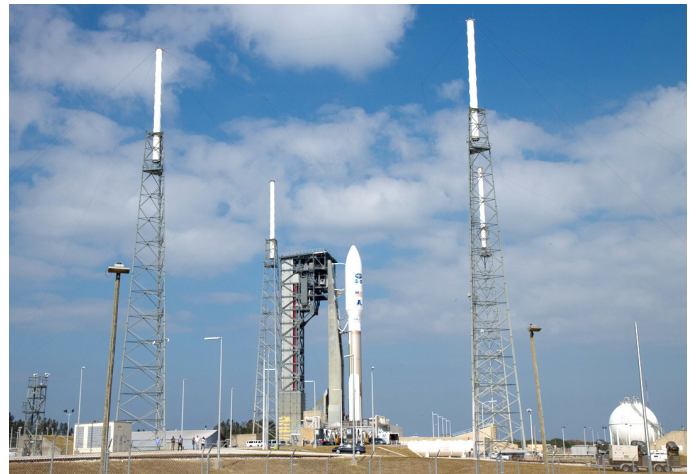
GOES-R on the launch pad after rollout on November 18.

On November 18, the United Launch Atlas V rocket and its GOES-R payload were moved from Kennedy Space Center's Space Launch Complex 41 Vertical Integration Facility to the launch pad in preparation for the November 19 launch. The Atlas V was in its 541 configuration, which means it has the five-meter-diameter payload fairing, four solid-fueled boosters and the Centaur upper stage is equipped with a single engine.