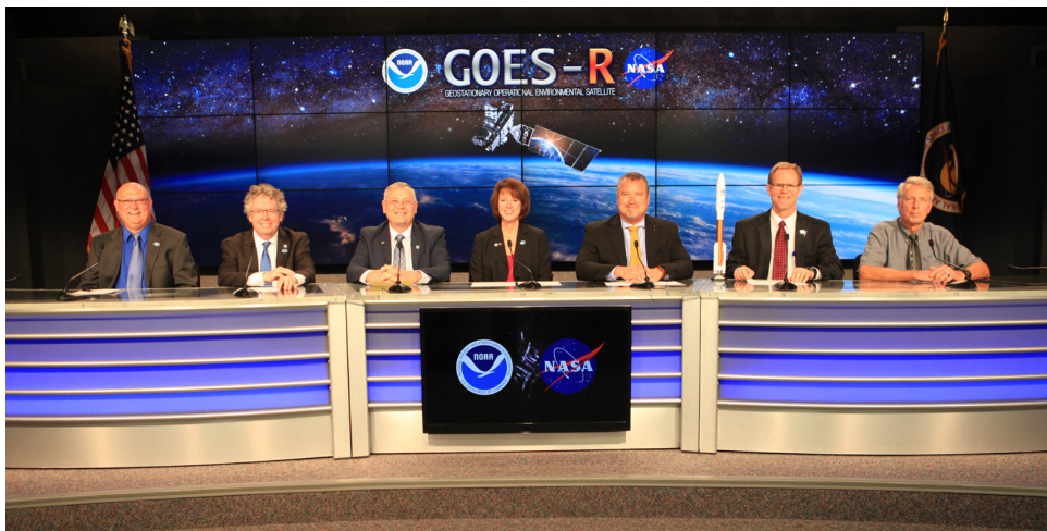
GOES-R L-2 press conference panelists.

The GOES-R pre-launch press conference was conducted at the Kennedy Space Center press site on November 17. The press conference included briefings on the GOES-R mission and launch readiness and included panelists from NOAA, NASA, United Launch Alliance, the National Weather Service, and the U.S. Air Force.