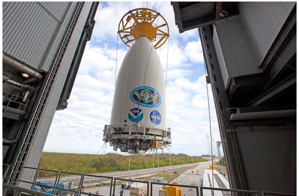
A crane lifts the GOES-R payload fairing for mating to the Atlas V centaur upper stage on November 9.

GOES-R was encapsulated in the payload fairing of the launch vehicle on October 21. The payload fairing protects the spacecraft during the ascent through Earth’s atmosphere. On October 24, the Atlas V first stage was placed on the stand in the Vertical Integration Facility at Space Launch Complex 41 at Cape Canaveral Air Force Station. The first stage of the Atlas V rocket holds the fuel and oxygen tanks that feed the engine for ascent and powers the spacecraft into orbit.