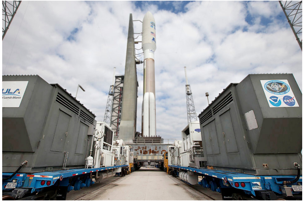
Rollout of GOES-R to the launch pad on November 18.

GOES-R completed a series of reviews and rehearsals in the final month before launch. On October 21, the NOAA Deputy Under Secretary of Operations concurred with the Key Decision Point E (KDP-E) recommendation to proceed to launch. This decision point confirmed that the end-to-end GOES-R system was fully integrated, the Mission Readiness Review was successfully completed, and the program was prepared for the Flight Readiness and Launch Readiness Reviews. The Spacecraft Mate Readiness Review was successfully completed on November 7. This review went over the procedures and roles and responsibilities for getting the spacecraft on top of the launch vehicle, which was successfully accomplished on November 9. The Mission Dress Rehearsal , a dry run for launch, was held on November 14, allowing the launch team to simulate launch procedures and activities. On November 15, the Flight Readiness Review certified the readiness to proceed with initiation of the final launch preparation activities. The final pre-launch review, the Launch Readiness Review , was completed on November 17, authorizing approval to proceed to the launch countdown.