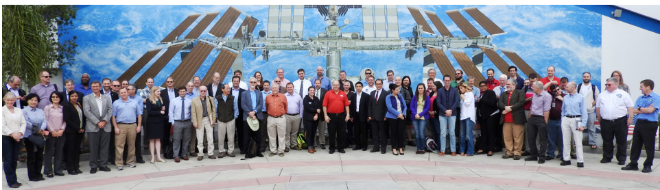
GOES-R science workshop participants.

Twenty-three grade 6-12 STEM (Science, Technology, Engineering, and Mathematics) teachers from the U.S. and Puerto Rico attended a GOES-R launch workshop for educators on November 18. The workshop gave the educators an opportunity to learn about GOES-R educational resources, lesson plans, and classroom activities and experience the launch live.