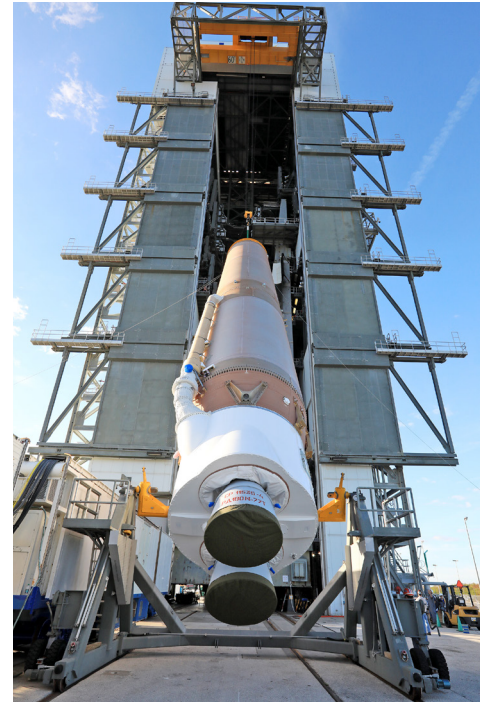
The Atlas V first stage for GOES-R is lifted to the vertical position at the integration facility at Space Launch Complex 41.

GOES-R was encapsulated in the payload fairing of the launch vehicle on October 21. The payload fairing protects the spacecraft during the ascent through Earth’s atmosphere. On October 24, the Atlas V first stage was placed on the stand in the Vertical Integration Facility at Space Launch Complex 41 at Cape Canaveral Air Force Station. The first stage of the Atlas V rocket holds the fuel and oxygen tanks that feed the engine for ascent and powers the spacecraft into orbit.