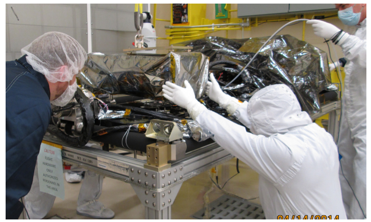
The EXIS instrument is installed on the sun-pointing platform of the GOES-R satellite.

The GOES-R ground segment Release Mission Man agement Upgrade (RMMU) was installed at the NOAA Satellite Operations Facility (NSOF) on April 7. Operationalization of RMMU was completed the next week, followed by a successful command and telemetry test