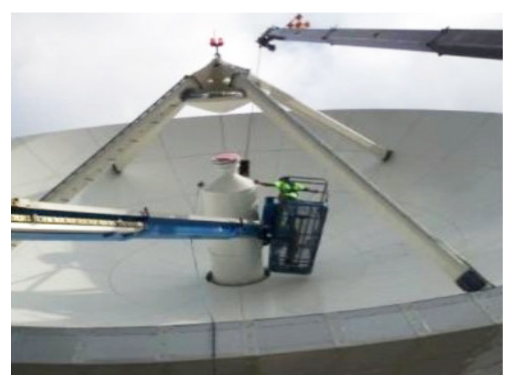
RBU R-2 antenna feed installation.

The PSR for the Remote Backup (RBU) facility R-2 antenna electronics was successfully held on April 22 in Richardson, Texas. The R-2 electronics were shipped to the RBU in Fairmont, West Virginia, in late April. In May, the R-2 electronics feed and R-3 antenna reflector panel were installed at RBU.