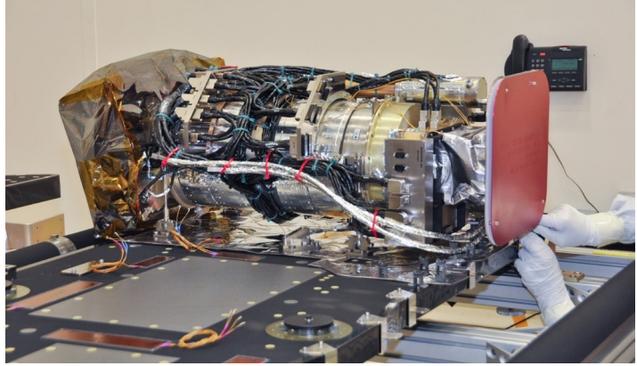
SUVI is shown installed on the sun-pointing platform of the GOES-R satellite.

Additional satellite components were integrated with the GOES-R spacecraft in April, including the data processing unit for the Space Environment In-situ Suite (SEISS) instrument, the Advanced Baseline Imager (ABI) electronics unit and cryocooler electronics, and the enhanced power conditioning unit.