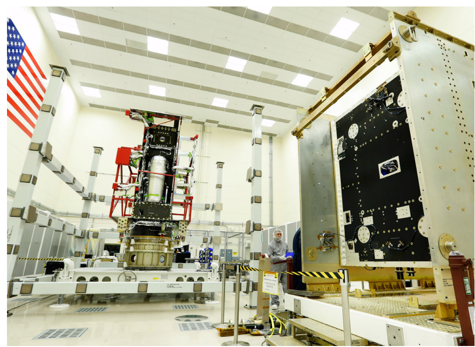
The GOES-R propulsion module (left) and system module (right) in the Lockheed Martin Littleton, Colorado, facility cleanroom.

The GOES-R spacecraft system module Pre-Shipment Review (PSR) was held April 11, at Lockheed Martin's facility in Newtown, Pennsylvania. The system module was shipped to Denver International Airport aboard a C-17 military transport aircraft, then completed its journey to Lockheed Martin's Littleton, Colorado, facility by convoy on April 16. The system module joined the propulsion module in the cleanroom and preparations are underway for the modules to undergo the integration and test phase of the GOES-R spacecraft development. The system and propulsion modules will be mated in July, prior to payload integration, functional testing and environmental testing in preparation for launch in 2016. Lockheed Martin issued a press release on May 1 to mark the milestone.