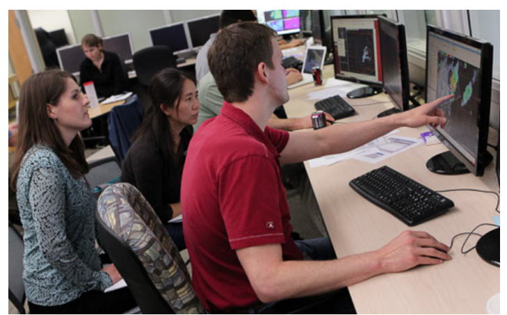
Forecaster/investigator interaction during the HWT 2014 Spring Experiment.

The GOES-R Proving Ground Hazardous Weather Testbed (HWT) 2014 Spring Experiment took place May 5-June 6, at NOAA's HWT in Norman, Oklahoma. A number of GOES-R severe weather products and tools were evaluated during the experiment. The Spring Experiment is a unique opportunity for researchers and forecasters to work side-by-side to evaluate emerging research concepts and tools and to participate in experimental forecast and warning generation exercises. For the first time, broadcast meteorologists were invited to the HWT under the sponsorship of the GOES-R program with the goal of understanding future capabilities and products from GOES-R and preparing for the production and dissemination of the new high-resolution information to the public. Details of the experiment, including demonstrations and forecaster feedback, can be found on the NOAA Hazardous Weather Testbed website and GOES-R Proving Ground Hazardous Weather Testbed blog.