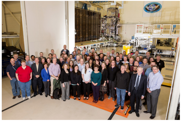
Attendees of the GOES-R Series Program spring summit pose with the completed GOES-R spacecraft in a Lockheed Martin cleanroom.

Lockheed Martin's facility in Littleton, Colorado, April 26-28. The summit brought together all elements of the GOES-R Series Program including spacecraft, instruments, and ground system teams to provide a comprehensive status review of the program. The summit focused on launch-related activities, operations, user readiness, and post-launch