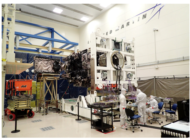
GOES-R in electromagnetic interference test configuration.

In June, GOES-R completed testing to confirm the electromagnetic signals produced by satellite components do not interfere with its operation, concluding a rigorous assessment to ensure the satellite can withstand the harsh conditions of launch and the space environment. Following a successful Pre-Shipment Review, GOES-R is now preparing