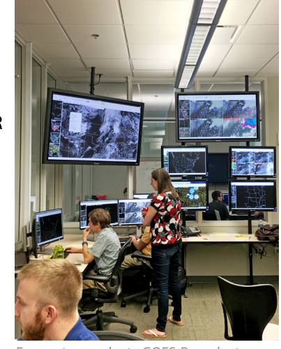
Forecasters evaluate GOES-R products during the 2016 Proving Ground HWT spring experiment.

The 2016 GOES-R/JPSS Proving Ground Hazardous Weather Testbed (HWT) spring experiment was conducted in Norman, Oklahoma, April 18-May 13. Each week, three National Weather Service forecasters and one broadcast meteorologist utilized simulated GOES-R products to issue experimental forecast updates and severe thunderstorm and tornado warnings. In conjunction with the HWT spring experiment, the GOES-14 backup satellite was brought out of storage and operated in Super Rapid Scan Operations for GOES-R (SRSOR) mode. The SRSOR experiment provided special one-minute imagery to simulate the capabilities that will be available with the GOES-R series ABI for evaluation by algorithm developers, research partners, forecasters, and Proving Ground participants.