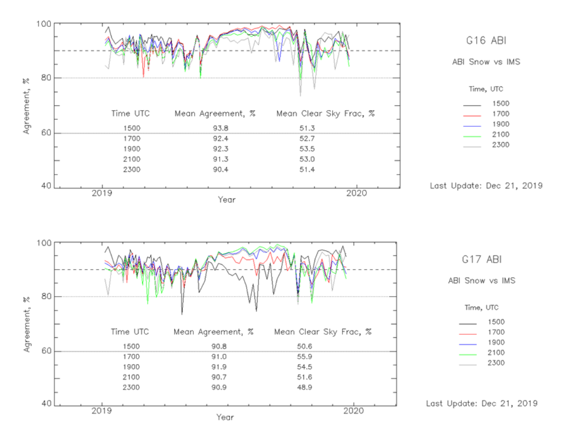
Figure 1 shows time series of the daily agreement rate between ABI snow maps and IMS over the Northern Hemisphere in 2019. The agreement rate generally ranges within 80 to 95% with the average value of around 90% in the fall, winter and spring season. The yearly mean agreement doesn't change much from GOES-16 (East) to GOES-17 (West) and generally ranges within 90 to 93%. This accuracy level fits a typical requirement of 90% correct snow/no-snow discrimination for binary snow cover products derived from satellite observations in the visible and infrared.