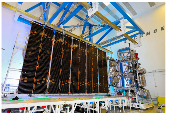
The GOES-T satellite in a clean room.